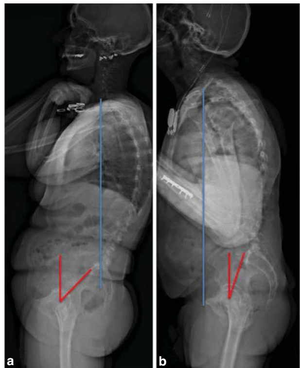
FIGURE 1. Panel a: Patient presenting negative SVA (-6.7 mm) and increased PT (37°). Panel b: Patient presenting increased SVA (990 mm) and normal PT (17°)