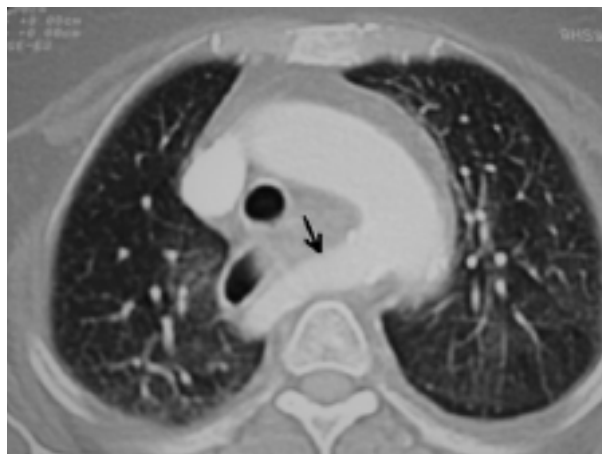
FIGURE 1 CT scan revealed a retroesophageal aberrant right subclavian artery.

The NRILN can be explained by the course of RILN development during the embryologic stage. In the embryo, both the right and the left inferior laryngeal nerves supply the sixth branchial arches. With the descent of the heart, the nerves pass beneath the sixth aortic arch and ascend to the larynx. On the right side, the distal portion