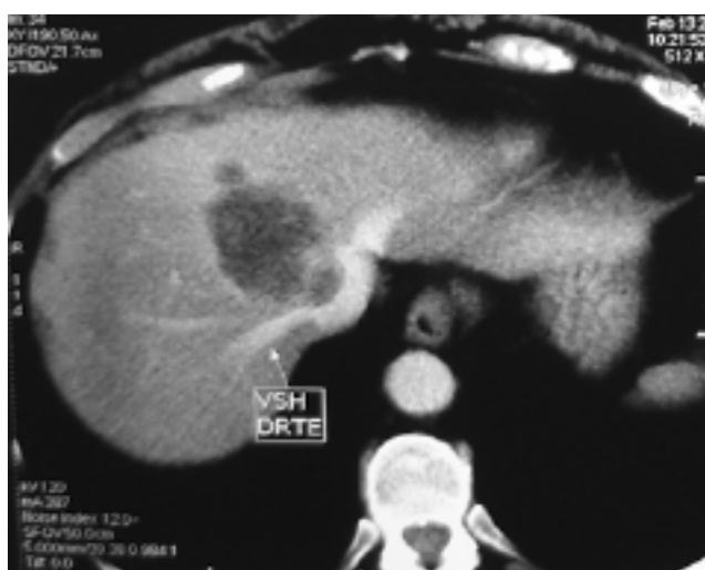
FIGURE 2 Computed tomography scan shows a liver metastasis from a colorectal carcinoma that infiltrates the right and middle hepatic veins with major compression of the supra-hepatic vena cava. Vessels dissection in preparation for hepatic vascular exclusion as a safe approach was performed at the beginning of the procedure. Involvement of the vena cava was less than expected by imaging studies and liver resection was achieved under intermittent portal triad clamping.