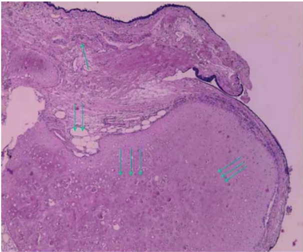
Figure 2. Histopathology

Histological section shows the typical respiratory epithelium (→), hyaline cartilage cell structures (⇔) and giant adipocytes (⇓), revealing the microscopic features of a hamartochondroma.